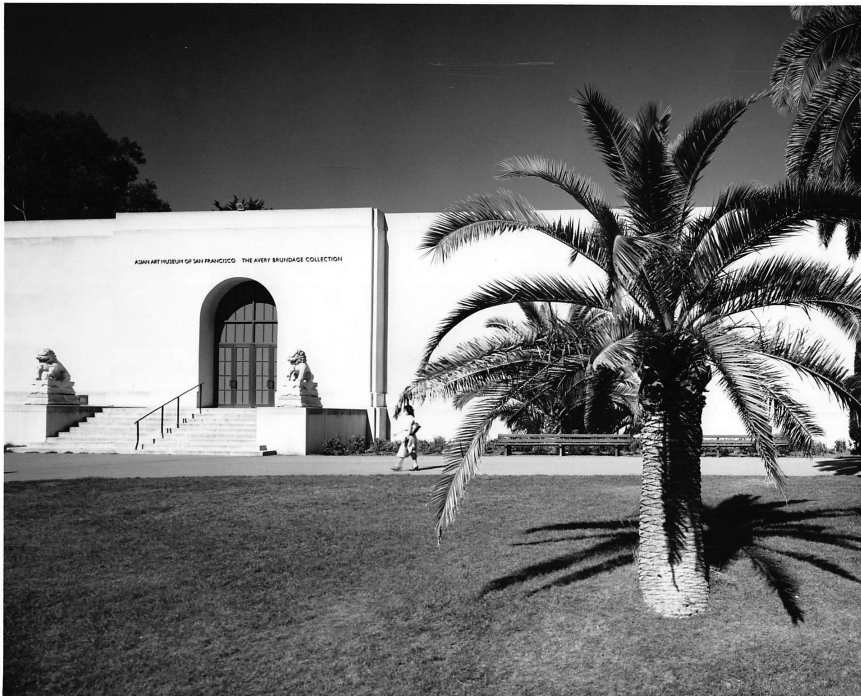
The Asian Art Museum in Golden Gate Park.

Look for photos of SAA events and activities over the last 60 years throughout this newsletter.