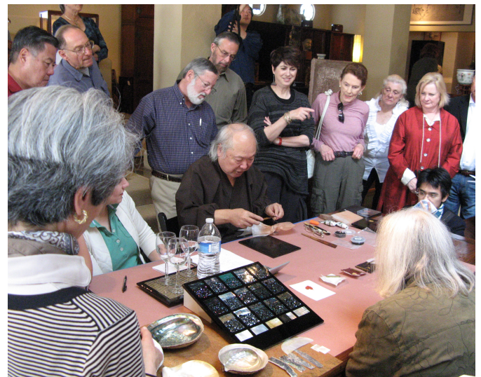
SAA members visiting with an artist.