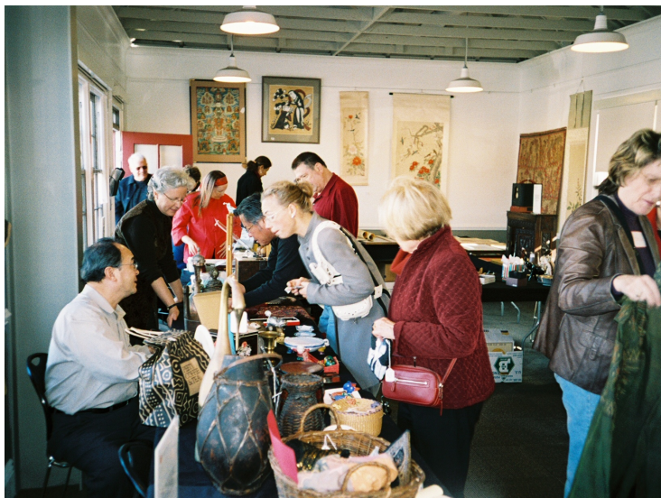
An early SAA Souk.