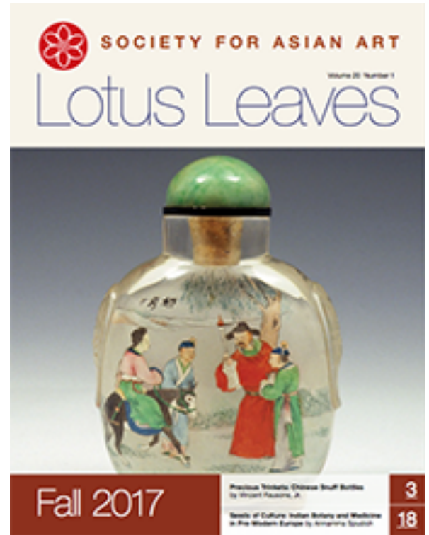
Cover of Fall 2017 Lotus Leaves issue