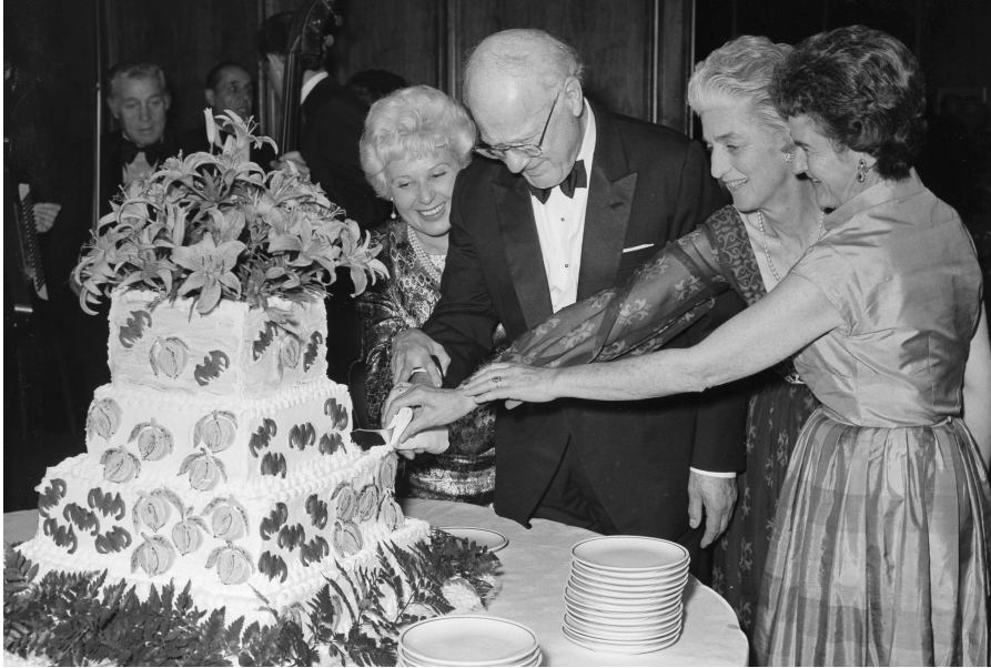
Avery Brundage with a few founders of the SAA.