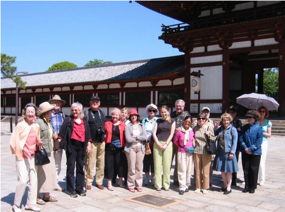
2007 SAA Trip to Japan.

Visit to Guillermina Asian Art and Antiques in Point Richmond