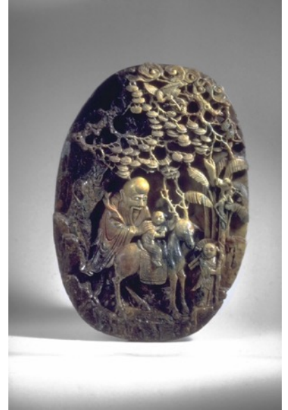
Medallion of Shoulao, god of longevity, 1936. China. Steatite. Asian Art Museum, The Avery Brundage Collection, B60J60.