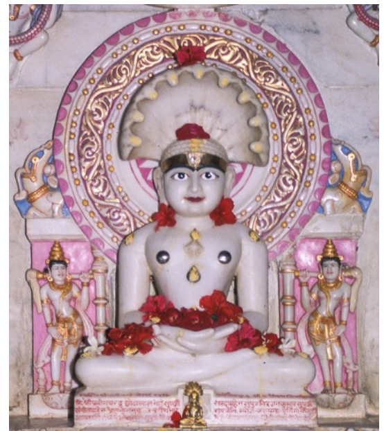
Śvetāmbara image of Pārśvanātha, taken near Ahmedabad