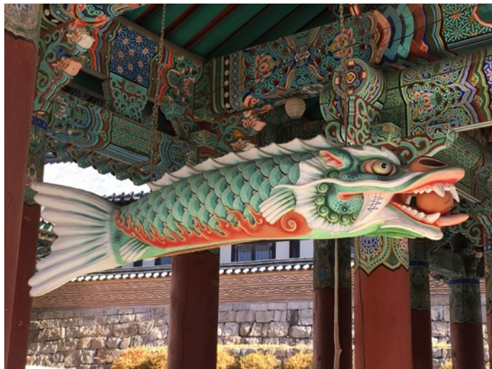
Haein Temple in South Korea

SAA's Annual Spring Dinner and 60th Anniversary Celebration