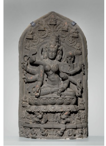
The Buddhist deity Vajra Tara, 1075–1200. India; perhaps Nalanda, Bihar state, Magadha region. Basalt. Asian Art Museum, The Avery Brundage Collection, B63S20+.