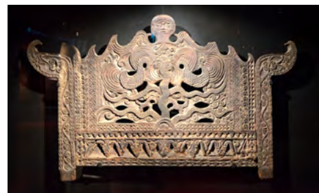
MUSÉE DU QUAI BRANLY