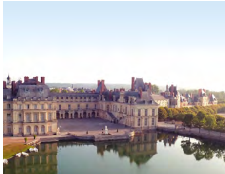
CHATEAU DE FONTAINEBLEAU