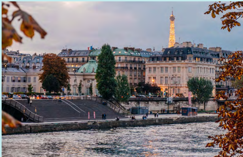
BANKS OF THE SEINE RIVER