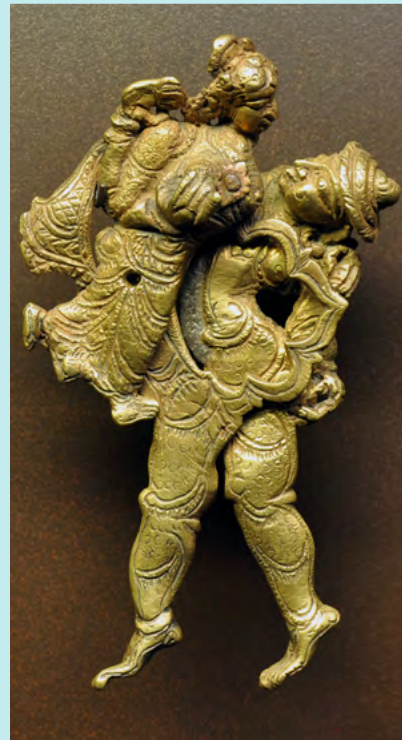
MUSÉE DU QUAI BRANLY