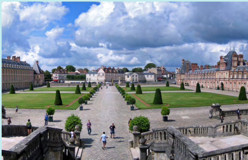
CHATEAU DE FONTAINEBLEAU