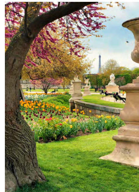
SPRING IN PARIS