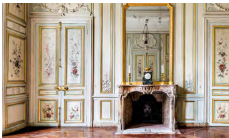
CHATEAU DE FONTAINEBLEAU