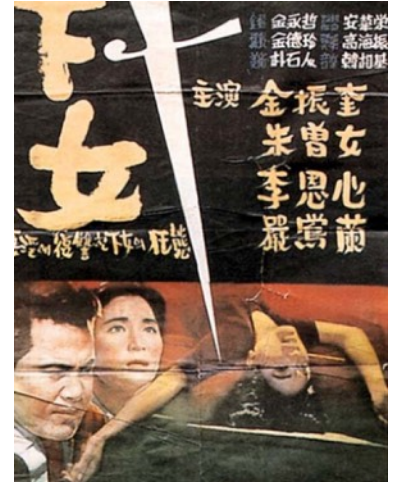
Theatrical poster of The Housemaid (1960), produced, written and directed by Kim Ki-young.