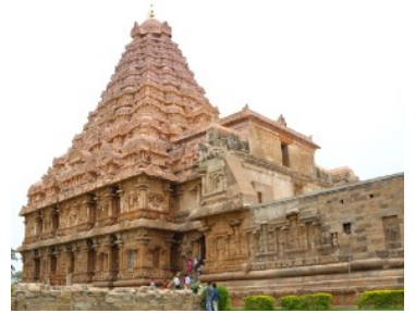
Temple at Gangaikonda Cholapuram.

A few spaces are still available on this fabulous trip! SAA travelers will be accompanied by excellent scholars to explore exotic temples as well as visit beautiful coastal cities. This trip will not only explore the living heritage of temples but will visit bronze workshops and weaving studios. We will be traveling through the locations in the very popular New York Times best selling book and Oprah's Book Club pick, The Covenant of Water , by Bay Area author and Stanford University School of Medicine professor Abraham Verghese. Please check Trips/Travel on our website to see the trip itinerary.