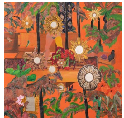
Bitter Skin, 2023, by Ranu Mukherjee. Pigment, ink, crystalina, and UV inkjet print on silk and cotton sari fabric on linen, 72 x 72 inches.