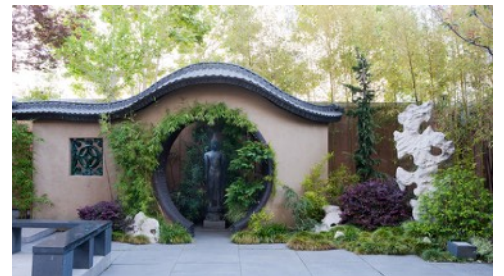
Peterson Room and Garden.

This event is limited to 50 people, so be sure to register now!