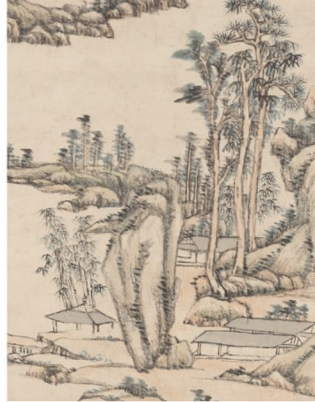
Left: Past Continuous Tense (detail), 2011, by Lam Tung Pang (Chinese, b. 1978, active Hong Kong and Vancouver). Charcoal, image transfer, and acrylic on plywood. Acquisition made possible by the Kao/Williams Foundation. Photograph © Asian Art Museum of San Francisco. Right: Landscape in the style of Ni Zan and Huang Gongwang, dated 1708, by Wang Yuanqi (Chinese, 1642–1715). Qing dynasty (1644–1911). Ink and colors on paper. Asian Art Museum, Museum purchase, B69D7. Photograph © Asian Art Museum of San Francisco.