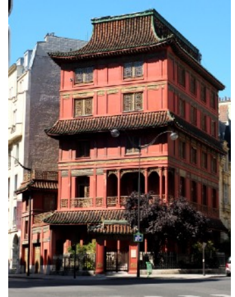
Red Pagoda.