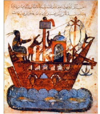
Zanji Merchants on a Mtepe Ship, 13th C.