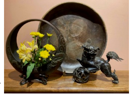
Bizen and Bronze Treasures of 19th Century Japan.

Attendance is limited, so please sign up early!