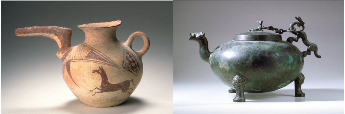
Left: Beak spouted jug with handle, approx. 900–700 BCE. Iran; Tepe Sialk, Kashan. Iron Age III (800–600 BCE). Painted earthenware. Asian Art Museum of San Francisco, The Avery Brundage Collection, B60P2009. Photograph © Asian Art Museum of San Francisco. Right: Ritual vessel (he) with lid, China. Warring States period (approx. 475–221 BCE). Bronze. Asian Art Museum of San Francisco, The Avery Brundage Collection, B60B907. Photograph © Asian Art Museum of San Francisco.

When: Fridays, Jan. 28 – May 6, 2022 (No lecture on Apr. 15.) Time: 10:30 a.m. to 12:30 p.m. Pacific Time except as noted Place: Samsung Hall & Online Webinars Fee: $200 per person Society members and $250 per person non-members for the series. Advance registration must be received by the SAA office no later than Jan. 21, 2022. We will only accept drop ins for individual lectures in Samsung Hall on a space available basis. Drop in fee is $25 per person per lecture.