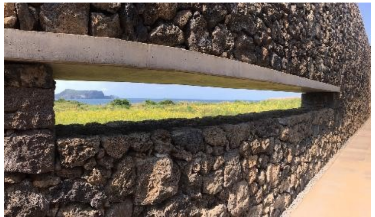
Genius Loci, Jeju Island

ARTful Korea: Contemporary Art Tour October 23 - November 2, 2021