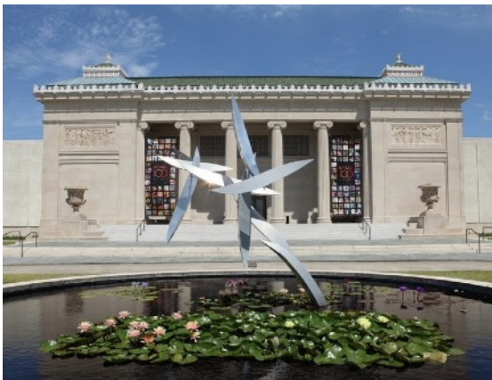
New Orleans Museum of Art

Asian Art and Heritage in NOLA April 14 - April 18, 2021