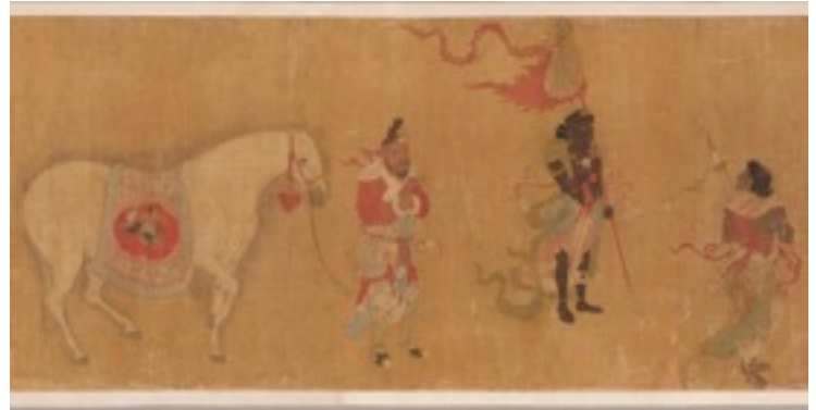
Tribute bearers, attributed to Ren Bowen (Chinese, 1254–1327). Ink and colors on silk. Asian Art Museum of San Francisco, The Avery Brundage Collection, B60D100.

The discussion continues in January 2018 when scholars focus on exchanges within and beyond Asia in Part II of Art on the Move across Asia and Beyond.