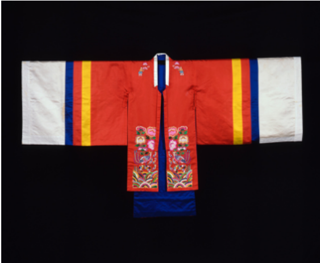
Bridal robe (hwalot), 1975, by Han Sang-soo (Korean, 1934–2016). Silk with embroidery. Asian Art Museum, Gift of the Museum Society Auxiliary, 1995.54.a-b.