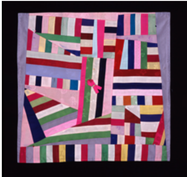
Wrapping cloth (bojagi), 1950–1960. Korea. Silk, pieced. Asian Art Museum, Gift of Mrs. Ann Witter, 2000.22.

Arts of Asia Spring Lecture Series, Art on the Move Across Asia and Beyond - Part II