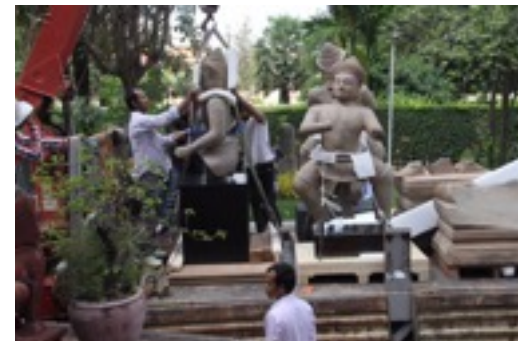
Restoration work at the National Museum of Cambodia

In the last half of the 20th century, Cambodia was a conflict-torn nation which experienced enormous destruction to all sectors of society. Large-scale looting and illicit trade in age-old antiquities led to many of these objects losing their original identities. Cambodia is now demonstrating a strong commitment to its heritage protection and conservation. With the help of UNESCO and the international community, the National Museum of Cambodia has been able to retrieve and study many of these lost objects.