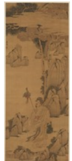
Hermit in landscape, approx. 1618–1652, by Chen Hongshou (Chinese, 1598–1652). Ink and colors on silk. Asian Art Museum, Museum purchase, B79D8.