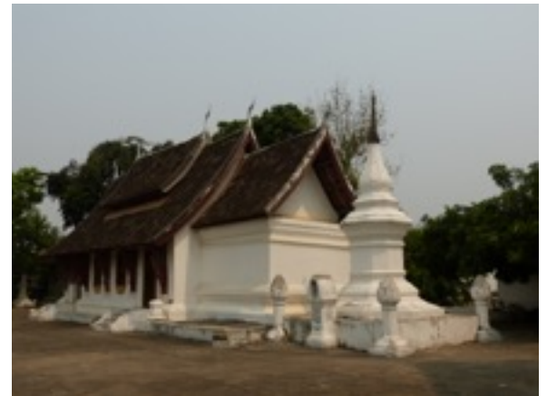
Vat Khili in Luang Prabang- Laos.