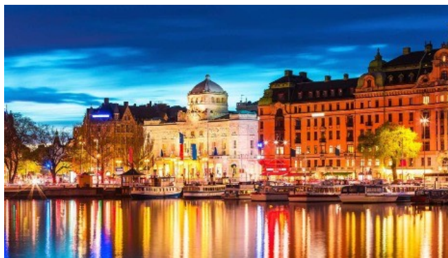
Left: Tivoli Gardens, Copenhagen. Right: Stockholm waterfront

Scandinavia – often associated with Viking legends and modern design – seems an improbable destination for great collections of Asian art. Yet countless Swedish and Danish archaeologists, missionaries, diplomats, and private individuals have donated objects to collections in Stockholm, Gothenburg, and Copenhagen. Expect an eye-opening, edifying, and entertaining experience! Highlights include visits to Stockholm's Museum of Far Eastern Antiquities and the Museum of Ethnography, Gothenburg's Röhsskamuseet, and Copenhagen's The David Collection and the National Museum of Denmark. This trip kicks off with an entertaining weekend in Visby, on the island of Gotland, where we will partake in the largest medieval festival in Europe. We hope you will join us!