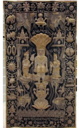
Ronald and Maxine Linde Collection, UCLA Fowler Museum of Art