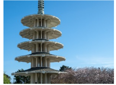
San Francisco Peace Pagoda with cherry blossom trees underneath.