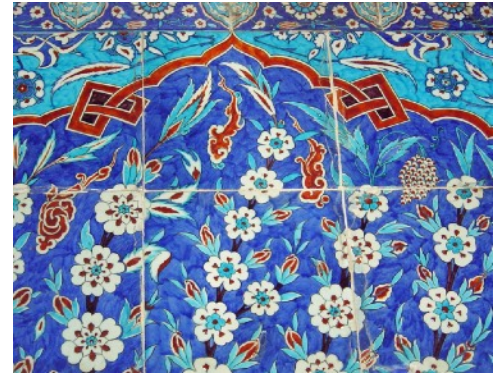
Rustem Pasha Mosque tiles 1560.