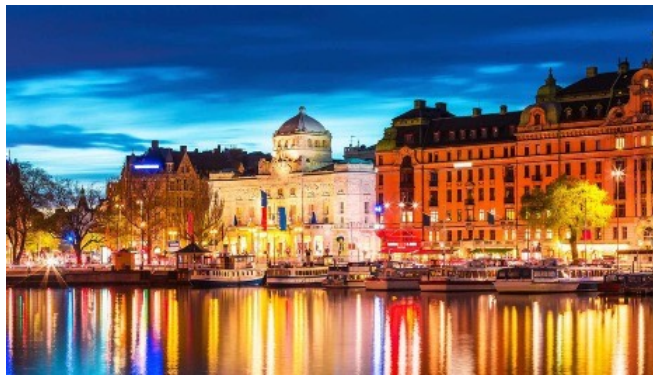
Left: Tivoli Gardens, Copenhagen. Right: Stockholm waterfront

Scandinavia – often associated with Viking legends and modern design – seems an improbable destination for great collections of Asian art. Yet countless Swedish and Danish archaeologists, missionaries, diplomats, and private individuals have donated objects to collections in Stockholm, Gothenburg, and Copenhagen. Expect an eye-opening, edifying, and entertaining experience! Highlights include visits to Stockholm's Museum of Far Eastern Antiquities and the Museum of Ethnography, Gothenburg's Röhsskamuseet, and Copenhagen's The David Collection and the National Museum of Denmark. This trip kicks off with an entertaining weekend in Visby, on the island of Gotland, where we will partake in the largest medieval festival in Europe. We hope you will join us!