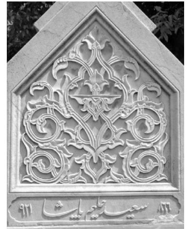
Arabesque pattern.