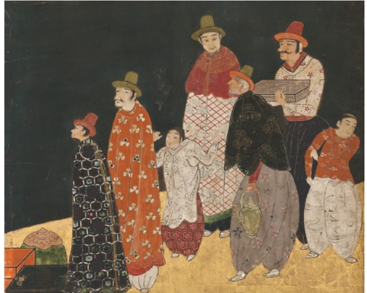
Left: Diversa Orbis Terræ , 1706, by Pieter Schenk (Dutch, 1660–1711). Ink and colors on paper. Asian Art Museum, Gift of David Salman and Walter Jared Frost, 2016.283. Photograph © Asian Art Museum. Right: Arrival of a Portuguese ship (detail), approx. 1620–1640. Japan. Six panel folding screen, ink, colors, and gold on paper. The Avery Brundage Collection, B60D77+. Photograph © Asian Art Museum.

When: Fridays, Aug. 25 – Dec. 8, 2023 (No lecture on Nov. 3 & Nov. 24) Time: 10:30 a.m. to 12:30 p.m. Pacific Time Place: Samsung Hall, Asian Art Museum & Online Webinars Fee: $200 per person Society members; $250 per person non-members for the series. We will only accept drop-ins for individual lectures in Samsung Hall on a space available basis. Drop-in fee is $20 per person per lecture. All in-person fees are after Museum admission. Instructor of Record: Sanjyot Mehendale