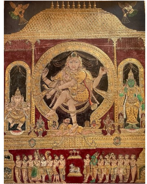
Shiva as Nataraja enshrined with dieties, approx. 1825-1875. India; Tamil Nadu state. Pigments, gold leaf, and limestone paste on cloth stretched over wood. Minneapolis Institute of Art, the Jane and James Emison Endowment for South Asian Art, 2014.57.

Email with trip details and registration instructions will be sent in early July. This trip is limited to 20 SAA members.