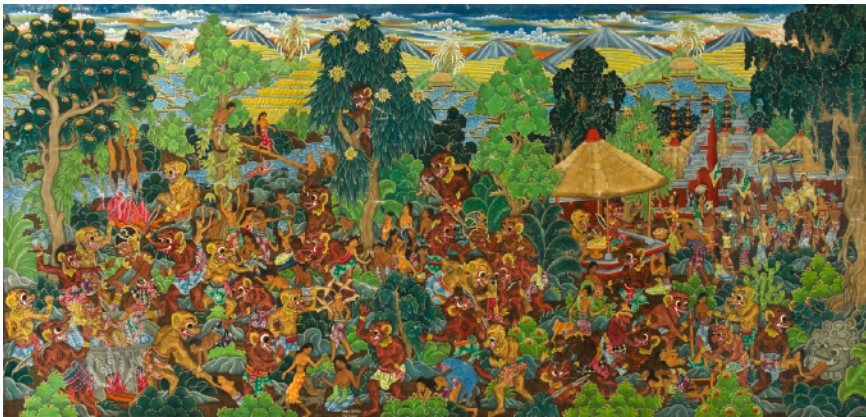
Bima Swarga, approx. 1970, by Wayan Ketig (Indonesian, 1930–2010). Pigment on cloth. Overall: 58 1/16 x 113 11/16 in. (147.5 x 288.8 cm.) Horniman Museum and Gardens, London, 1988.2.

Don't miss the chance to see the special exhibition, Hell: Arts of Asian Underworlds , on view June 16 through September 18, 2023. The majority of the 48 works on view are on loan from other institutions and collections. Several of the Asian Art Museum's pieces are newly acquired and are being shown for the first time.