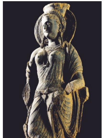
Tyche, Gandhara, 3rd century. Schist. H: 36". BAMPFA. On long-term loan from a private collection.