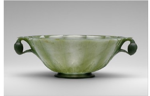
Chrysanthemum bowl, India, 18th century. Metropolitan Museum of Art, New York City.