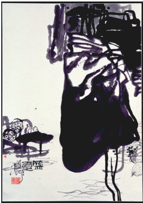
Middle Summer, approx. 1980–1990, by Pan Gongkai (Chinese, b. 1947). Ink on paper. Asian Art Museum, Museum purchase, Jack Anderson Collection Fund with assistance from the artist, 1998.52.

Enjoy these paintings of nature in the Asian Art Museum's collection.