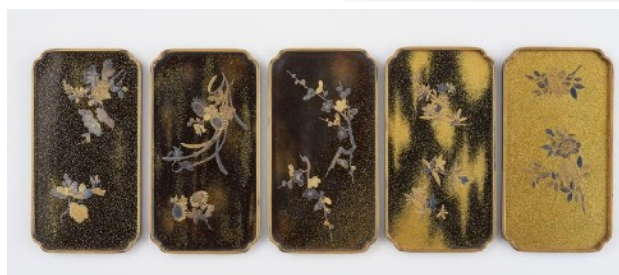
Picnic set with design of four seasonal flowers and Chinese children at play, approx. 1800–1868. Japan. Edo period (1615–1868). Lacquer and gold on wood. Asian Art Museum, The Avery Brundage Collection, B60M156.a-n.