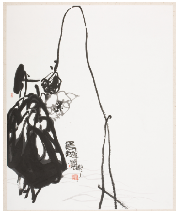
Morning Delight, 2007, by Pan Gongkai (Chinese, b. 1947). Ink on paper. Asian Art Museum, Gift of Pan Gongkai, 2007.48.