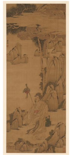
Hermit in landscape, approx. 1618–1652, by Chen Hongshou (Chinese, 1598–1652). Ming dynasty (1368–1644) or Qing dynasty (1644–1911). Ink and colors on silk. Asian Art Museum of San Francisco, Museum purchase, B79D8.