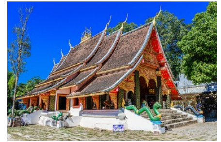
Temple in Luang Prabang

When: Wednesdays, January 6, 13, 20 and 27, 2021 Time: 2:00 p.m. to 3:30 p.m. Pacific Time Place: Online Webinars Fee: $50 per person Society members; $70 per person non-members for the series Advance registration must be received by the SAA by December 30, 2020.