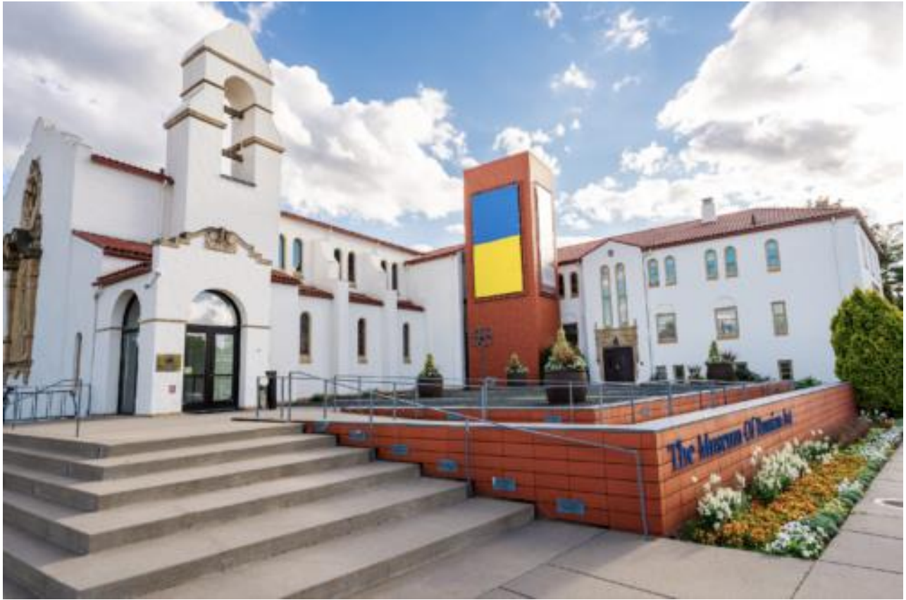
The Museum of Russian Art, housed in a former church since 2005