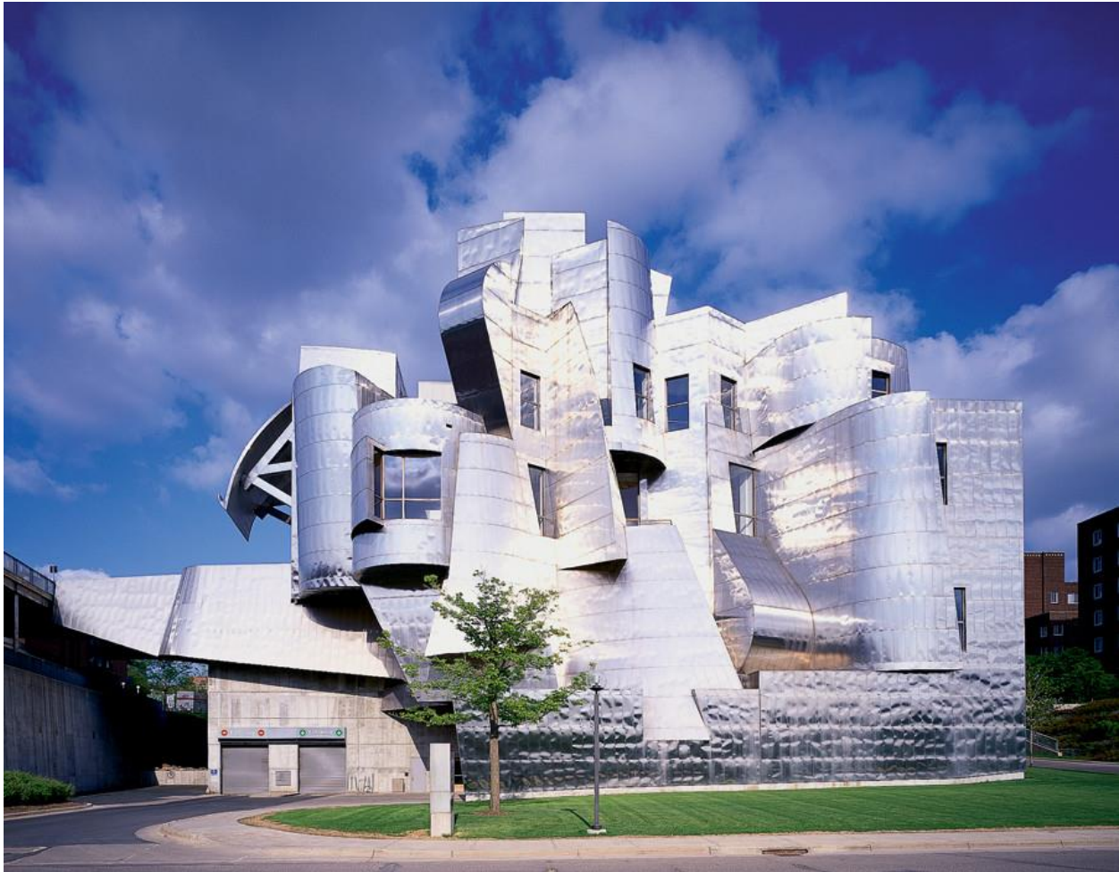
Weisman Art Museum at the University of Minnesota, designed by the Canadian-born American architect Frank Gehry, completed in 1993, and renamed in honor of art collector and philanthropist Frederick R. Weisman.