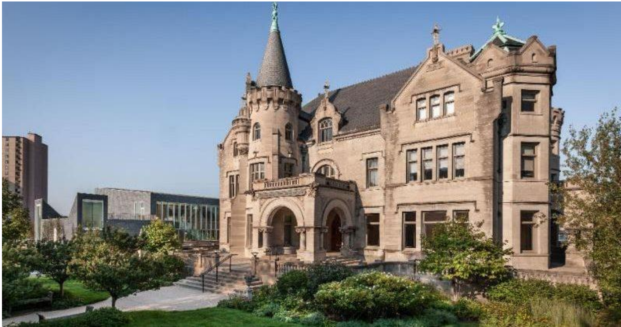
The Swan Turnblad Mansion (1903-10) now housing the American Swedish Institute, was added to in 2012 for expanded gallery space, reception area, shop and café.