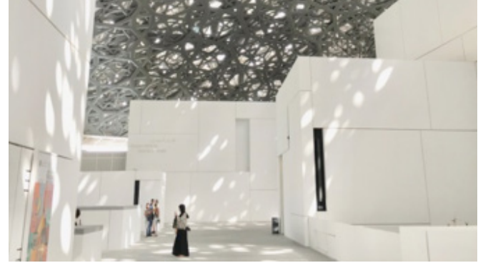
Louvre Abu Dhabi