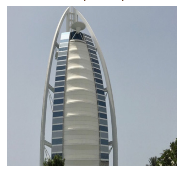
Burj Al Arab

"We reserve the right to change the order of activities or places visited due to unforeseen schedule conflicts or in order to make the itinerary run smoothly"