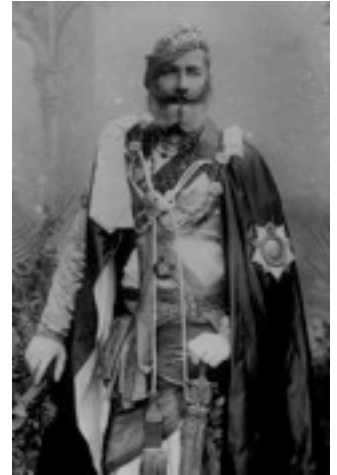
Pratap Singh of Orcha