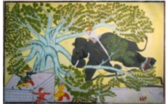
Enraged Elephant. India, Rajasthan, Kota, c. 1740. Opaque color on paper. Private Collection.

The story of western exposure to Indian painting is rife with drama, enormous egos, and fascinating history. The first Indian paintings known to have come to the West are in the Laud Ragamala album presented by William Laud, the Archbishop of Canterbury, to the Bodleian Library in Oxford around 1640, just a few decades after its creation and a few years before Laud was executed by order of Oliver Cromwell. This less than auspicious beginning augured a checkered future for the collection of Indian painting, which, not surprisingly, was closely linked to the British colonial enterprise. Another early collector was the brilliant and eccentric William Beckford, whose 18th century collecting career coincided with the gradual dispersal of the Moghul imperial library.