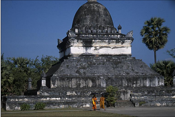
Wat Wisunalat, Luang Prabang

Come join the Society for Asian Art as we explore the art and culture of the 21 st century and of centuries past in Laos and Vietnam. Contrasts between old and new, past and present are seen throughout Southeast Asia, but are most strikingly evident in these two fascinating countries. On one day in Vietnam, we will be very much in the present as we dine with local professionals in their private homes discussing the art and culture of today. On another day, we will transport ourselves back to 192 AD and the kingdom of Chama as we explore the Cham temple ruins. The journey between past and present continues all the way to the magical Laotian city of Luang Prabang situated between the Mekong and Nam Khan Rivers. Here you will see beautiful textiles made using techniques that have remained the same over the centuries. You will also have the opportunity to dine at a variety of restaurants with cuisine rivaling the menus in any of today's major cities. The SAA is proud to offer this specially crafted journey to Vietnam and Laos giving you the opportunity to immerse yourself in their cultures, their histories and their ideas.