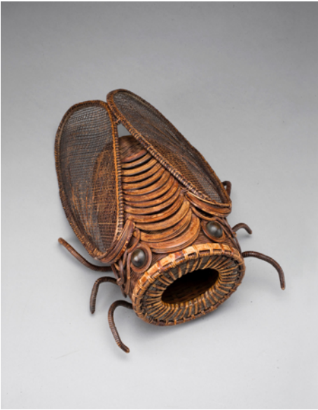
Hanging flower basket in the shape of a cicada, approx. 1915–1950. Japan; probably kansai. Bamboo (madake variety), rattan, wood, and metal; twining, openwork square plaiting, and bundled plating. Asian Art Museum of San Francisco, Lloyd Cotsen Japanese Bamboo Basket Collection, 2006.3.11.

As we approach the 50 th anniversary of San Francisco's Summer of Love, we will celebrate the importance of flowers in Asian culture with the upcoming exhibition, Flower Power . In keeping with that theme, pictured here are a few of the Asian Art Museum's superb collection of Japanese baskets for Ikebana, the art of flower arranging. Be sure to see the exquisite baskets on display in the Japanese Galleries on the second floor!