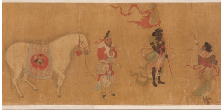
Tribute bearers, attributed to Ren Bowen (Chinese, 1254–1327). Ink and colors on silk. Asian Art Museum of San Francisco, The Avery Brundage Collection, B60D100.

The fourteen lectures in Fall 2017 will look at the roles of art—ceramics, metalwork, textiles, painting, sculpture, architecture, fashion, and the performing arts—in spreading knowledge and sparking global trade. Leading scholars and curators will share research and insights on how images of the Buddha traveled East, monks on the move 1,300 years ago, Marco Polo’s travels during the Pax Mongolica, traffic along the Silk Road and sea routes, the Bodhisattva of Compassion’s gender issues, costume exchange East and West, and more. The Spring 2018 lectures will continue the discussion on what happens when art changes hands across cultural borders.