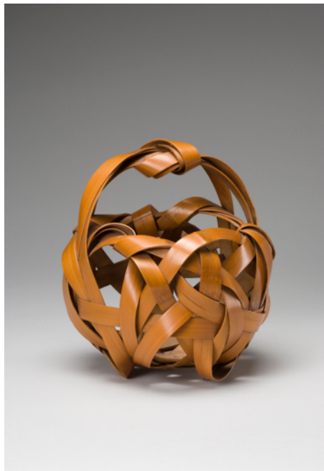
Flower arranging basket, approx. 1900–1980. Japan. Bamboo. Asian Art Museum of San Francisco, Lloyd Cotsen Japanese Bamboo Basket Collection, 2006.3.48.