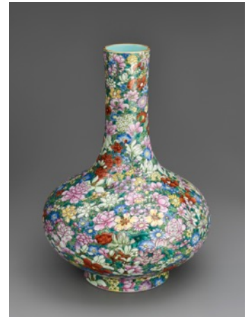
Vase with “one hundred flowers” motif. China; Jingdezhen, Jiangxi province, Qing dynasty, reign of the Qianlong emperor (1736–1795). Porcelain with overglaze enamels. Asian Art Museum of San Francisco, The Avery Brundage Collection, B65P13.