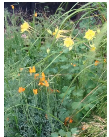
Columbine, California Poppy and native Feather Grass