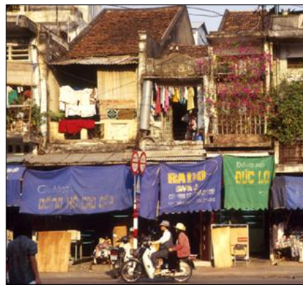
Hanoi's ancient quarter