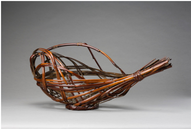
Flower basket, approx. 1950–1975. Japan. Bamboo (hobichiku variety); openwork irregular plaiting. Asian Art Museum of San Francisco, Lloyd Cotsen Japanese Bamboo Basket Collection, 2006.3.256.