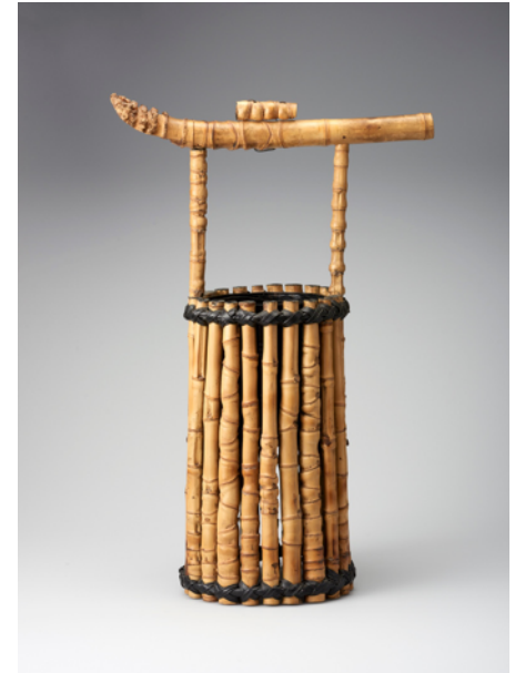
Flower arranging basket, 1900–2000. Japan. Bamboo. Asian Art Museum of San Francisco, Lloyd Cotsen Japanese Bamboo Basket Collection, 2006.3.168.

As we approach the 50 th anniversary of San Francisco's Summer of Love, we will celebrate the importance of flowers in Asian culture with the upcoming exhibition, Flower Power . In keeping with that theme, pictured here are a few of the Asian Art Museum's superb collection of Japanese baskets for Ikebana, the art of flower arranging. Be sure to see the exquisite baskets on display in the Japanese Galleries on the second floor!