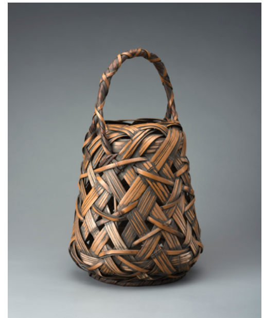
Flower basket, 1850–1950. Japan. Bamboo. Asian Art Museum of San Francisco, Lloyd Cotsen Japanese Bamboo Basket Collection, 2006.3.380.