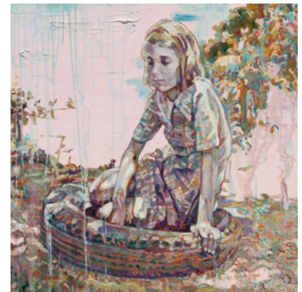
Hung Liu, Lily Pad , 2017, oil on canvas.