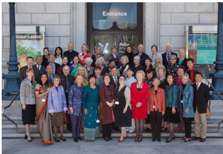
Docent Graduation 2014

The Asian Art Museum will open applications for a new docent training class on April 20 th . The training will start on September 8, 2017 and will emphasize touring school audiences. If you're interested in receiving the announcement, please email cgutierrez@asianart.org or look for the online application at asianart.org .