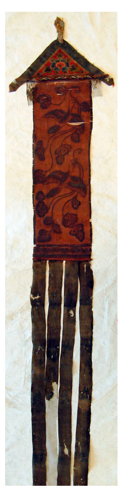
Figure 1-6: Silk banner from Dunhuang, Gansu Province. 8th–9th cent.

The Dunhuang textile collections (now in London, Paris, and New Delhi) are consistent in their use of fabrics, motifs, and shapes, which presumably reflect those popular in the area. However, those found during the Turfan-Prussian expeditions at the beginning of last century (1902–1914), now part of the Turfan Collection in the Asian Art Museum in Berlin, have different features; only a few seem related to the Dunhuang Tang style. One item in particular is a triangular pennant that we see represented in the Kizil wall paintings and also as a decoration of architectural wooden elements from the caves (see Figure 1-7). Kizil paintings and textiles show less Chinese influence, and are more Indo-Iranian in style and colors.<sup>8</sup> These devotional items were created with recycled textiles and paper that were originally used to compensate the soldiers sent to the western regions, or to "gift" monks for their prayers and for their services to build and paint the cave-temples of local aristocratic families. Docu-