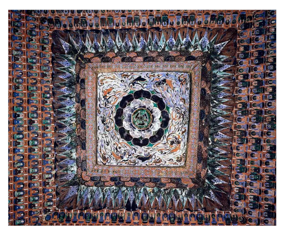
Figure 1-5: Ceiling in the shape of a canopy with a central floral medallion and three interlocked hares. Dunhuang Cave 407, Gansu Province, China. Sui dynasty (581-618).

languages, for centuries until they were discovered and brought to Europe by the Hungarian archaeologist Sir Marc Aurel Stein (1862– 1943) and the French Asianist Paul Pelliot (1878–1945). Particularly intriguing are banners in the shape of a human body, with head, arms and legs (generally made with different textile fragments), found in various sizes, and also depicted on the walls and on other textile items (see e.g., Figure 1-6). Some of the caves' ceilings are also painted in the shape of textile canopies showing roundels and lotus flowers like giant mandalas. These images correspond to a few of the fragments discovered in situ .