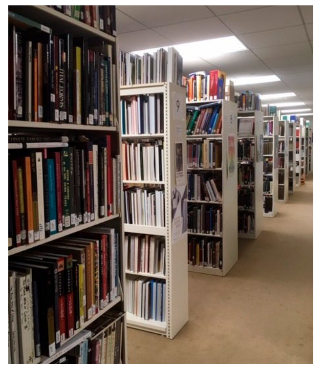
Another view of ranges in the main stacks on the 4th floor.