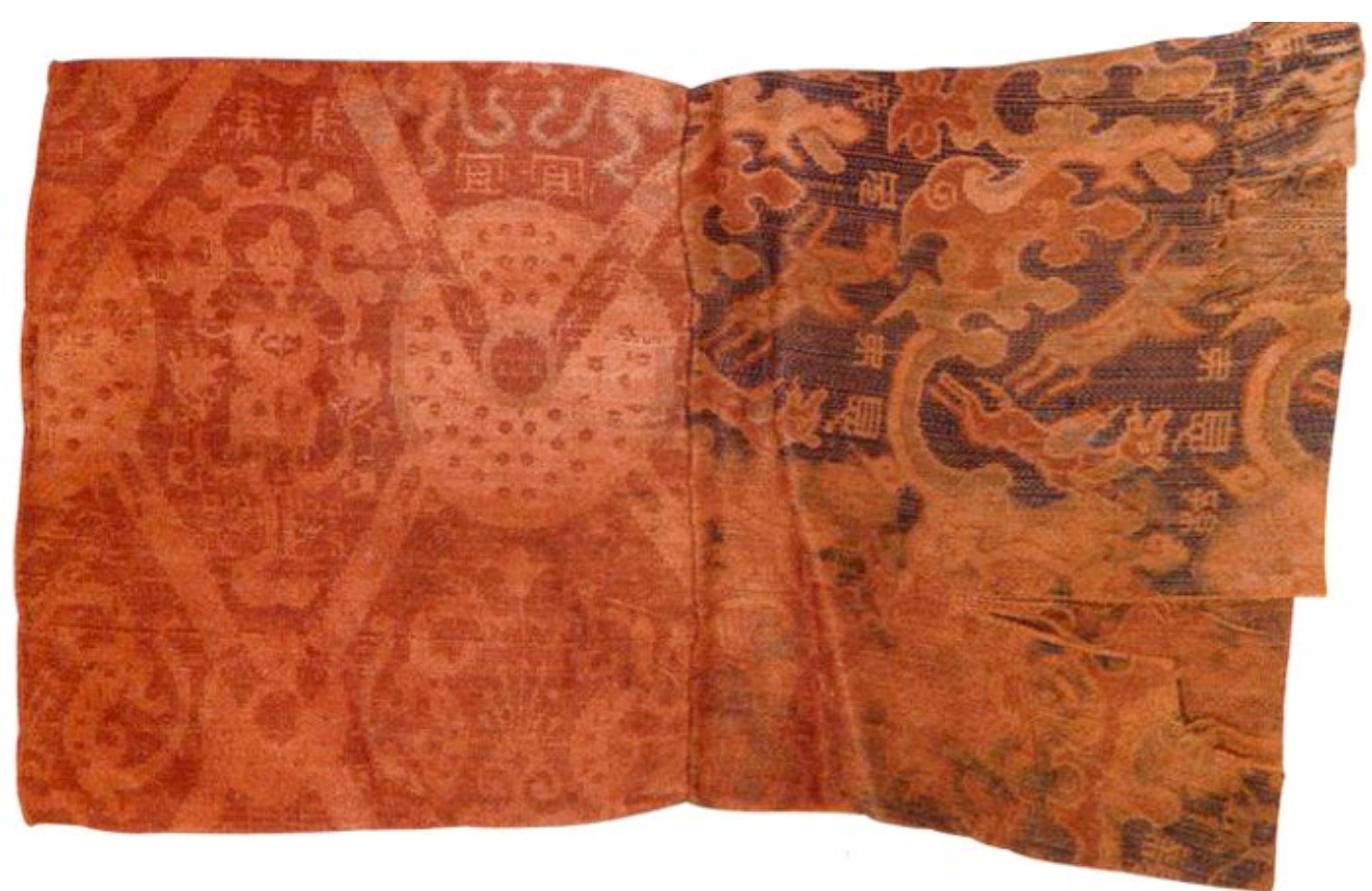
Figure 1-1: Sleeve made of two warp-faced weavings: a red ground with jade bi and a tree with the "Mother of the West" and Chinese characters, and a wusijin (five color compound) with clouds, beasts, and Chinese characters. Han period (206 BCE–220 CE).