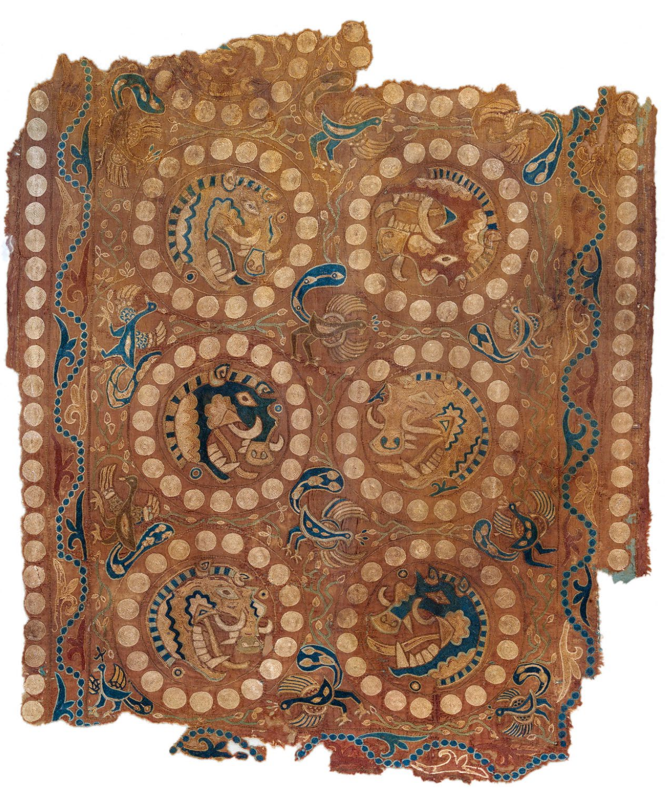
Figure 1-9 and Cover: Textile with Boar's Head Roundels. Silk split-stich embroidery on plain-weave silk. Iran, Afghanistan or China, 7th cent.