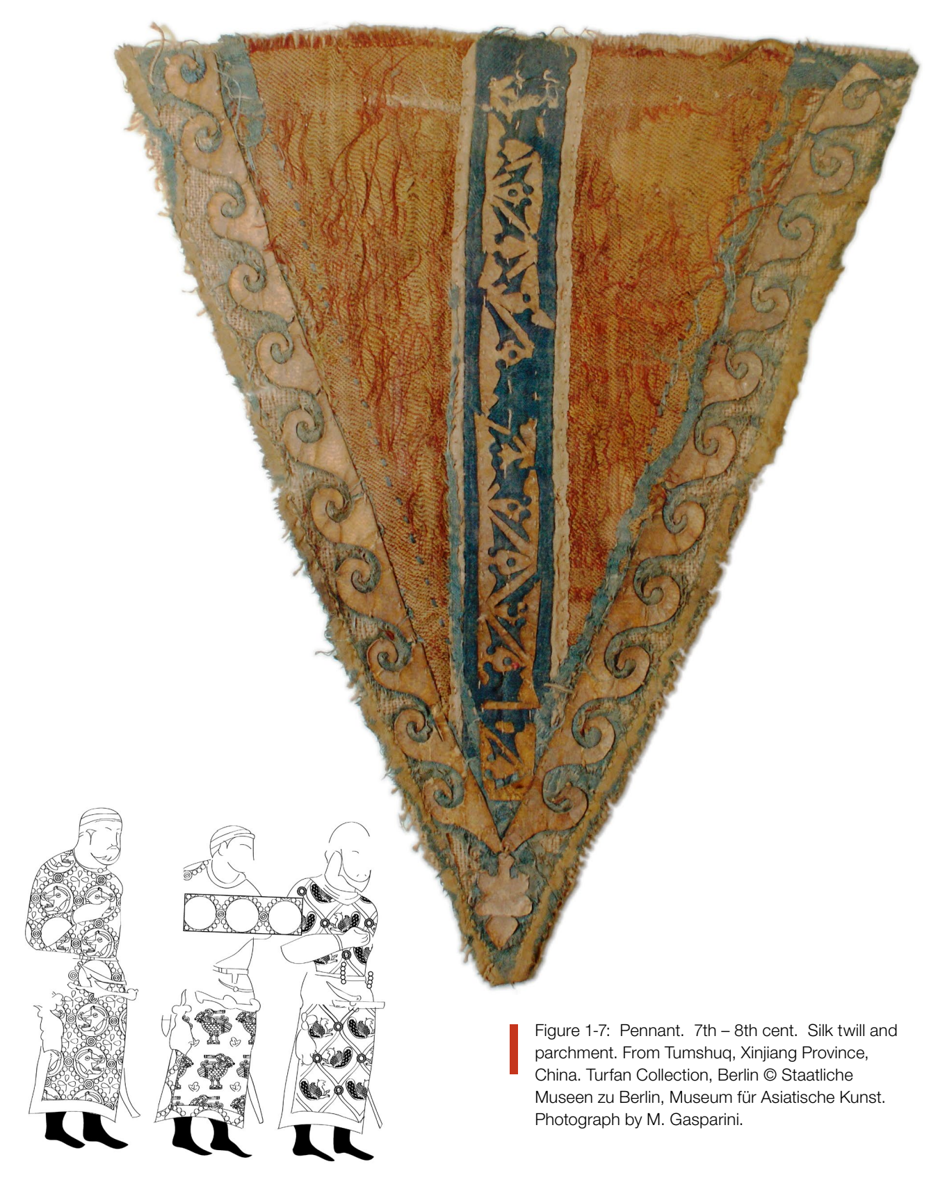
Figure 1-8: The "Sasanian Ambassadors" wearing three different robes depicting boars' heads, ducks and simurghs. Afrasiyab (Samarkand), Uzbekistan, 7th cent. Reconstruction by M. Gasparini