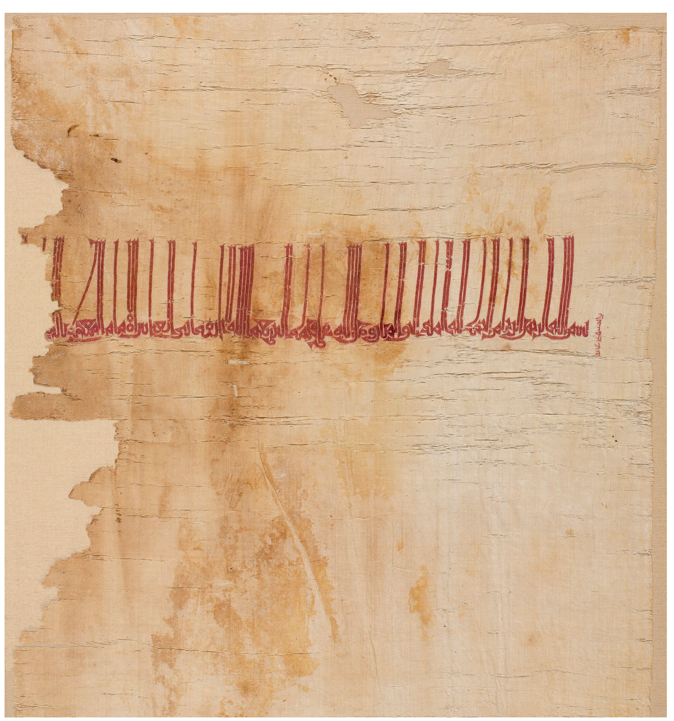
Figure 1-11: Tiraz fragment. Silk warp and cotton weft; plain weave, embroidered. Ca. 892–902 Eastern Iran or Khurasan.