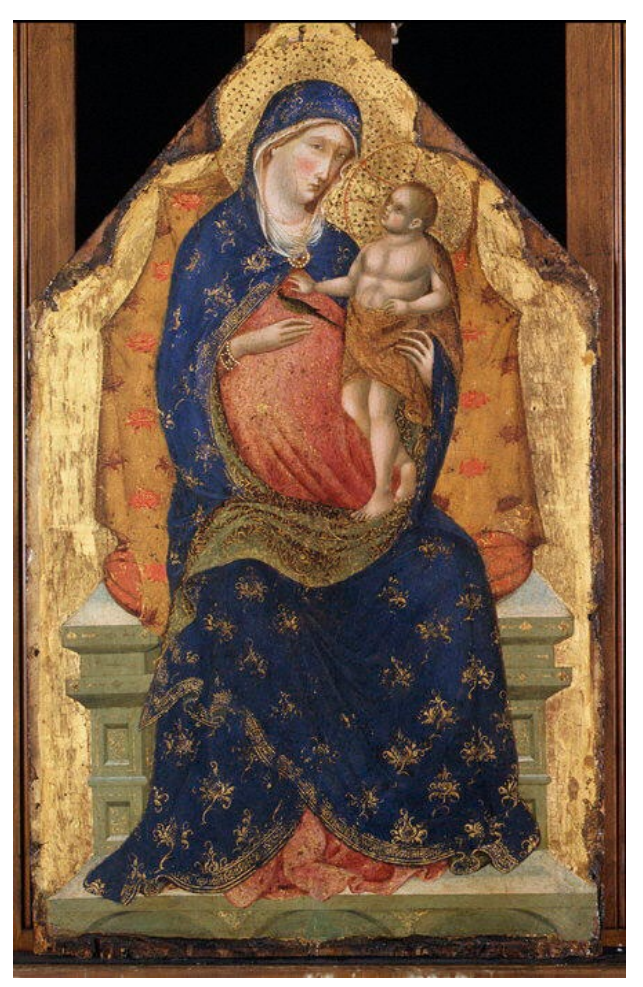
Figure 1-15: Madonna (wearing a "Tartar" mantle) and Child Enthroned . Paolo Veneziano, ca.1350. Tempera on wood.

The golden weavings of the Mongols became a popular and accepted visual form of communication across their vast Eurasian empire. From the 14th century the nasij weavings appear in Italian documents as panno tartarici or also tar tareschi, tartarini, tarsici, or more specifically as nachoni, nacchi, nachetti or nasicci . These terms all referred to weavings from the East, and differed from panni saracini or saracinati that were produced only in the Islamic Mediterranean. Not only were these weavings copied in Italy, but with their arrival, new pictorial movements began using golden thread. Just as Buddhas and Bodhisattvas in Central Asian caves had been