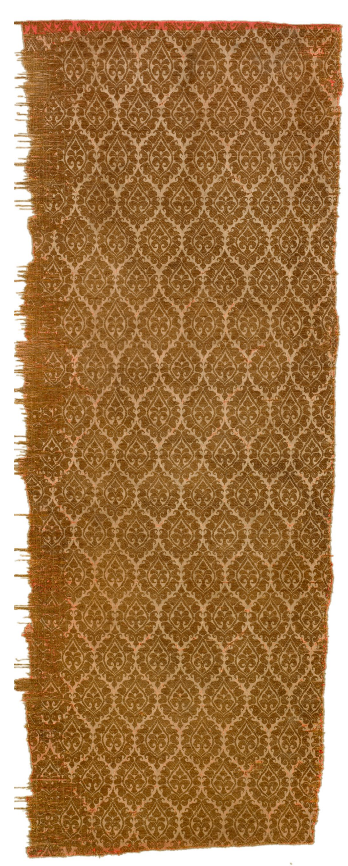
Figure 1-14: Nasij. Tabby with supplementary weft, golden and silver threads. 13th -14th cent. Central Asia.