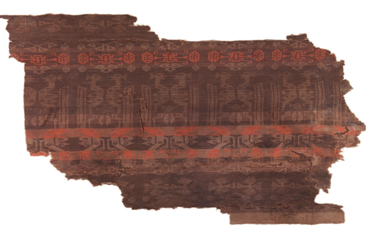
Figure 1-3: Warp-faced fragment. Eastern Zhou dynasty, Warring States period (475–221 BCE).