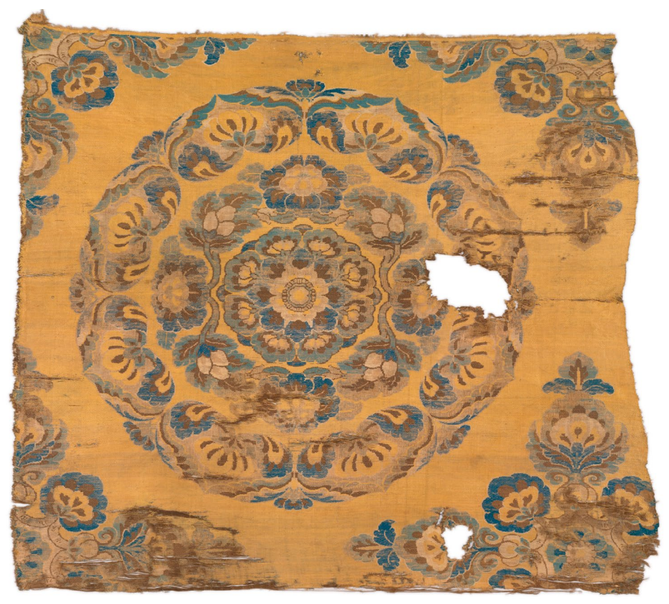
Figure 1-4: Weft-faced fragment with floral medallion, Tang dynasty (618-907).