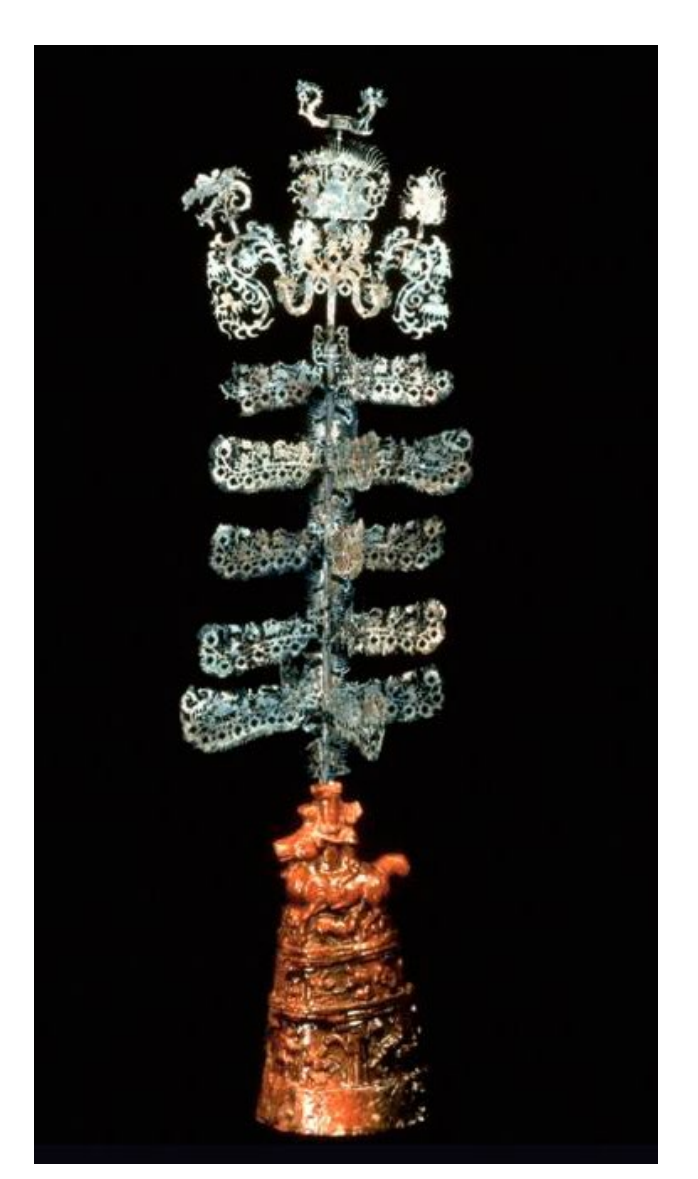
Figure 1-2: Money tree with "Mother of the West" and the Buddha figure. Bronze with glazed earthenware base. Eastern Han period (25-220 CE).

at the well-preserved red caftan made with a composition of golden yellow, Roman-style cherubs, we might think that he was a person from the Eastern Roman Empire, but a recent analysis has confirmed that the weaving was an eastern production. Most likely, the Yingpan man was a merchant of unknown origin who traded between East and West, or a Central Asian who had adopted Western costume and habits and had purchased his outfit from one of the local Xinjiang workshops that produced fashionable copies of Western weavings and motifs.<sup>6</sup>