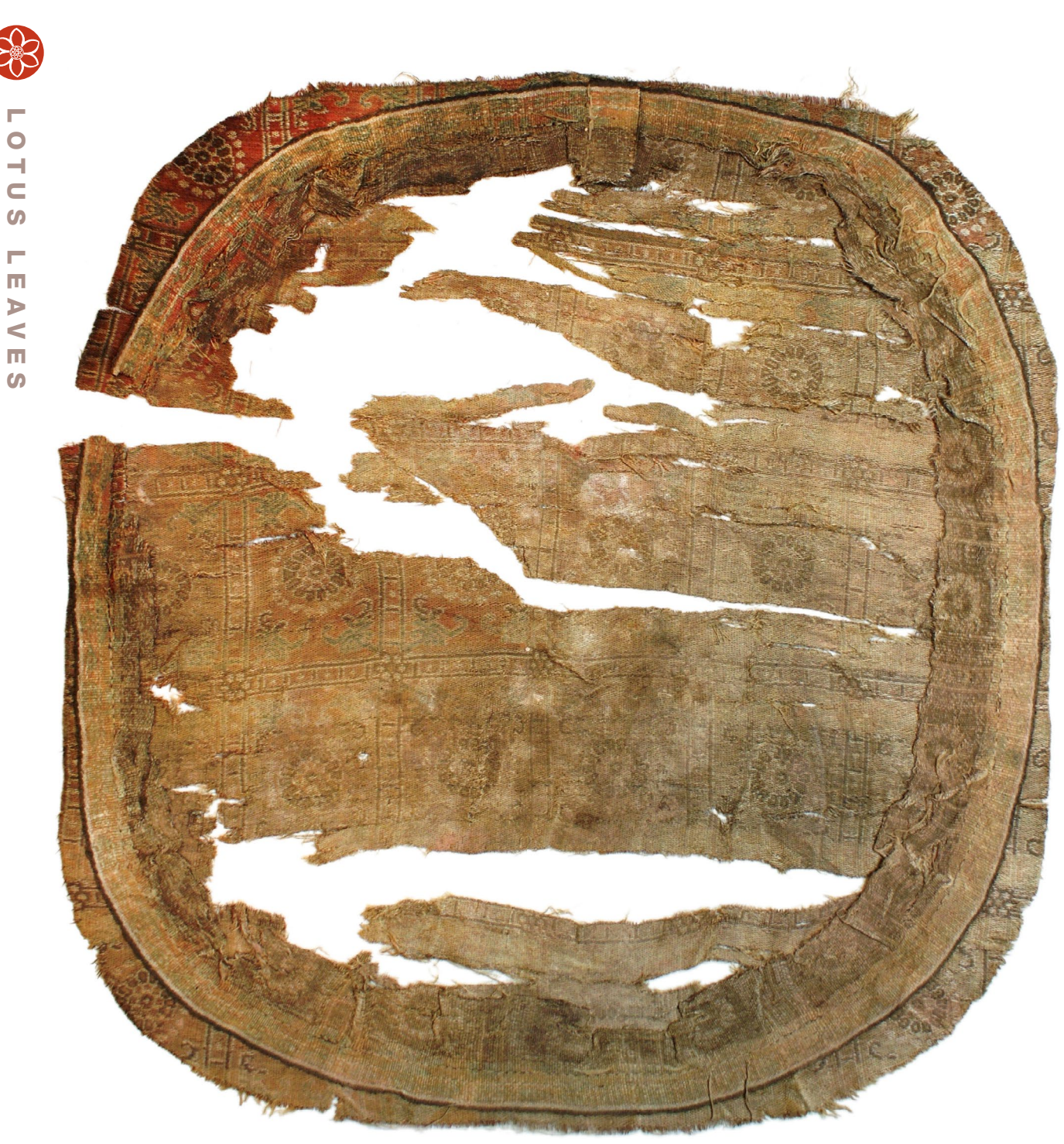
Figure 1-10: Honjin canopy. Tang Dynasty (618-907). Silk warp-faced tabby. From Toyok, Xinjiang Province, China. Turfan Collection, Berlin