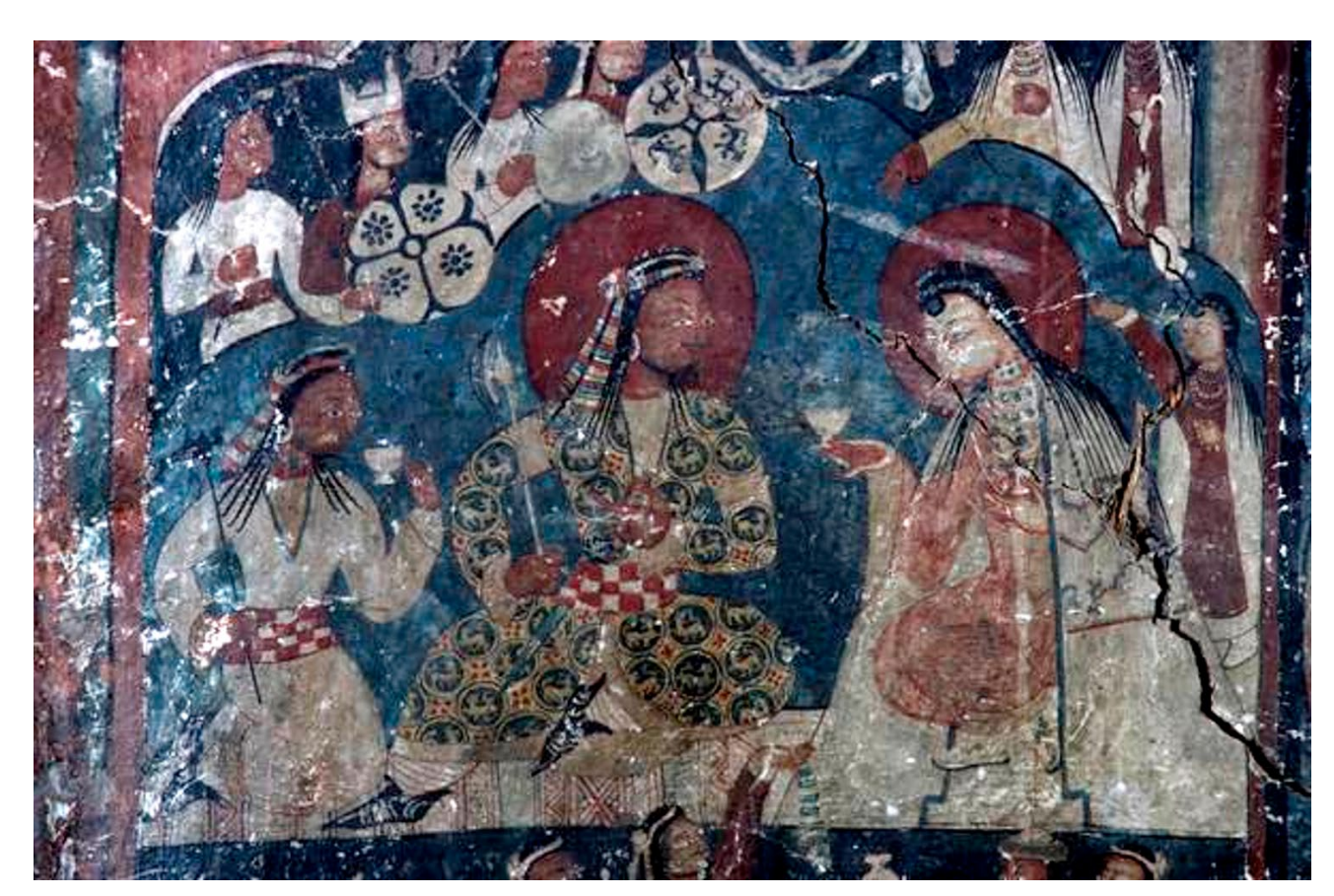
Figure 1-12: Libation scene. 10th -13th cent. Wall painting. Alchi complex, Ladakh, India.

in Sens creates a sequence of colors in an alternate and reverse repeat (1-2 / 2-1) for the first, and 1-2-3-4 / 4-3-2-1 for the latter) that clearly seems to circulate in Eurasia at the time, and confirms the transfer of weaving techniques and styles.<sup>12</sup>